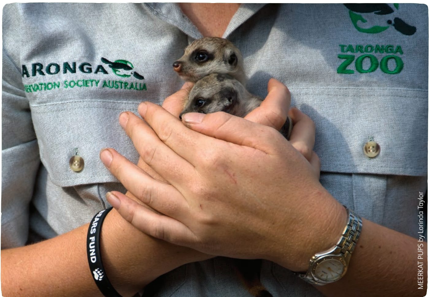
MEERKAT PUPS by Lorinda Taylor

http://educationstandards.nsw.edu.au/wps/portal/nesa/11-12/stage-6-learning-areas/hsie/business-studies