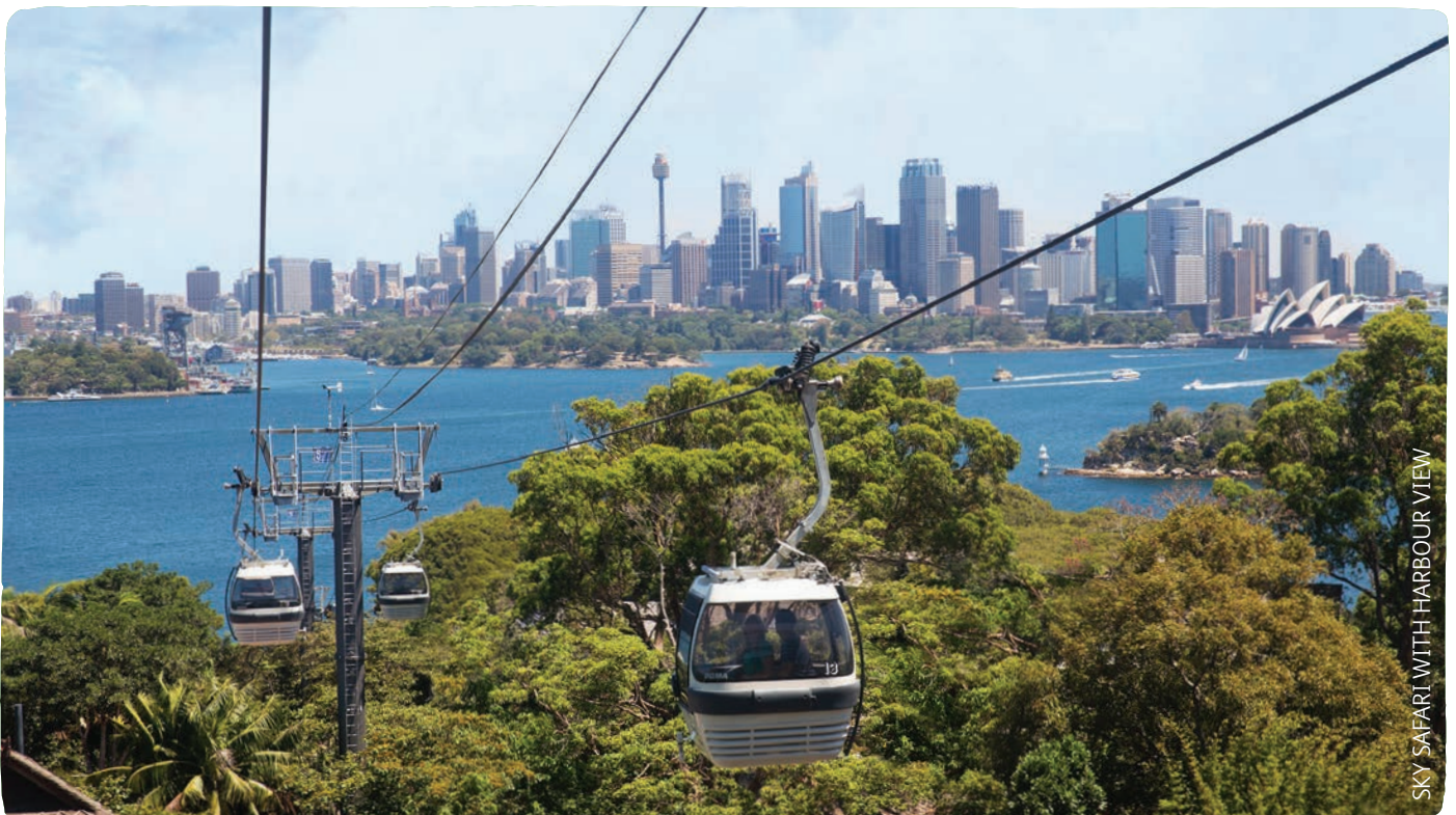
SKY SAFARI WITH HARBOUR VIEW